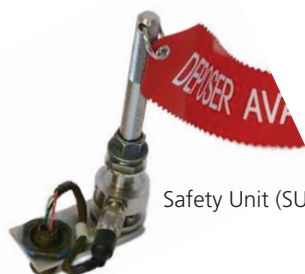
Safety Unit (SU)