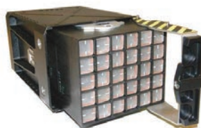
Cartridge Dispenser Module (CDM)